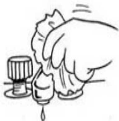
6. Turn off taps with towel