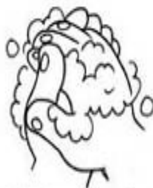
3. Scrub backs of hands, wrists, between fingers, under fingernails.