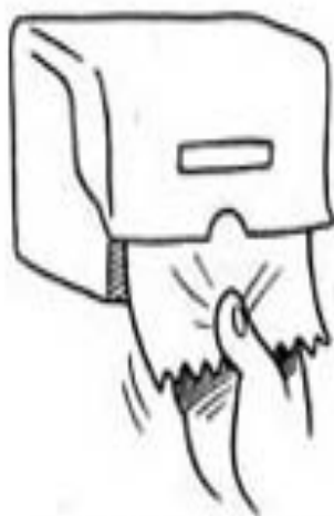
5. Towel dry