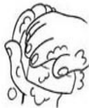
2. Soap (20 seconds)