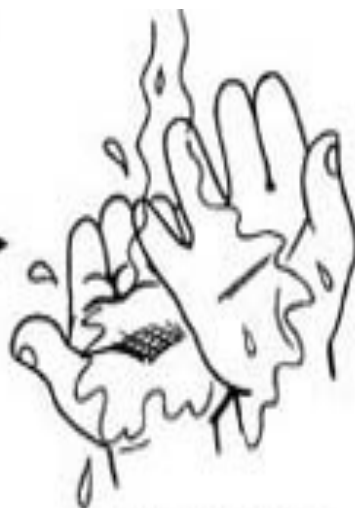
1. Wet hands